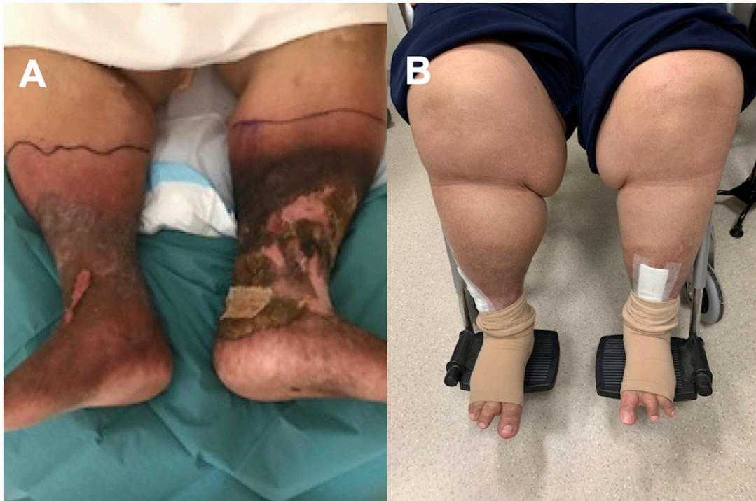
Fig. 2. Pre-operative and Post-operative Clinical Picture of a Patient with Bilateral CEAP 6 Venous Disease. A , Pre-operative clinical picture demonstrating bilateral limb swelling, diffused venous skin changes and venous stasis ulcers. B , Clinical picture of bilateral limbs 6 months post-operation, demonstrating significant alleviation of symptoms.